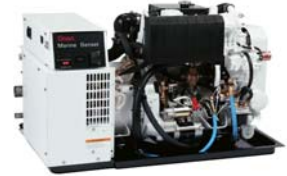
Standard Model without Sound Shield Shown.