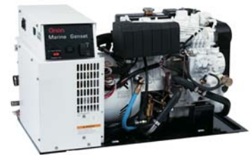
Standard Model without Sound Shield Shown