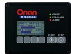
e-series Digital Display